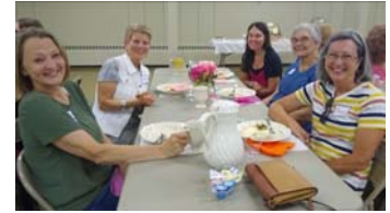
Wings Mother/Daughter Brunch